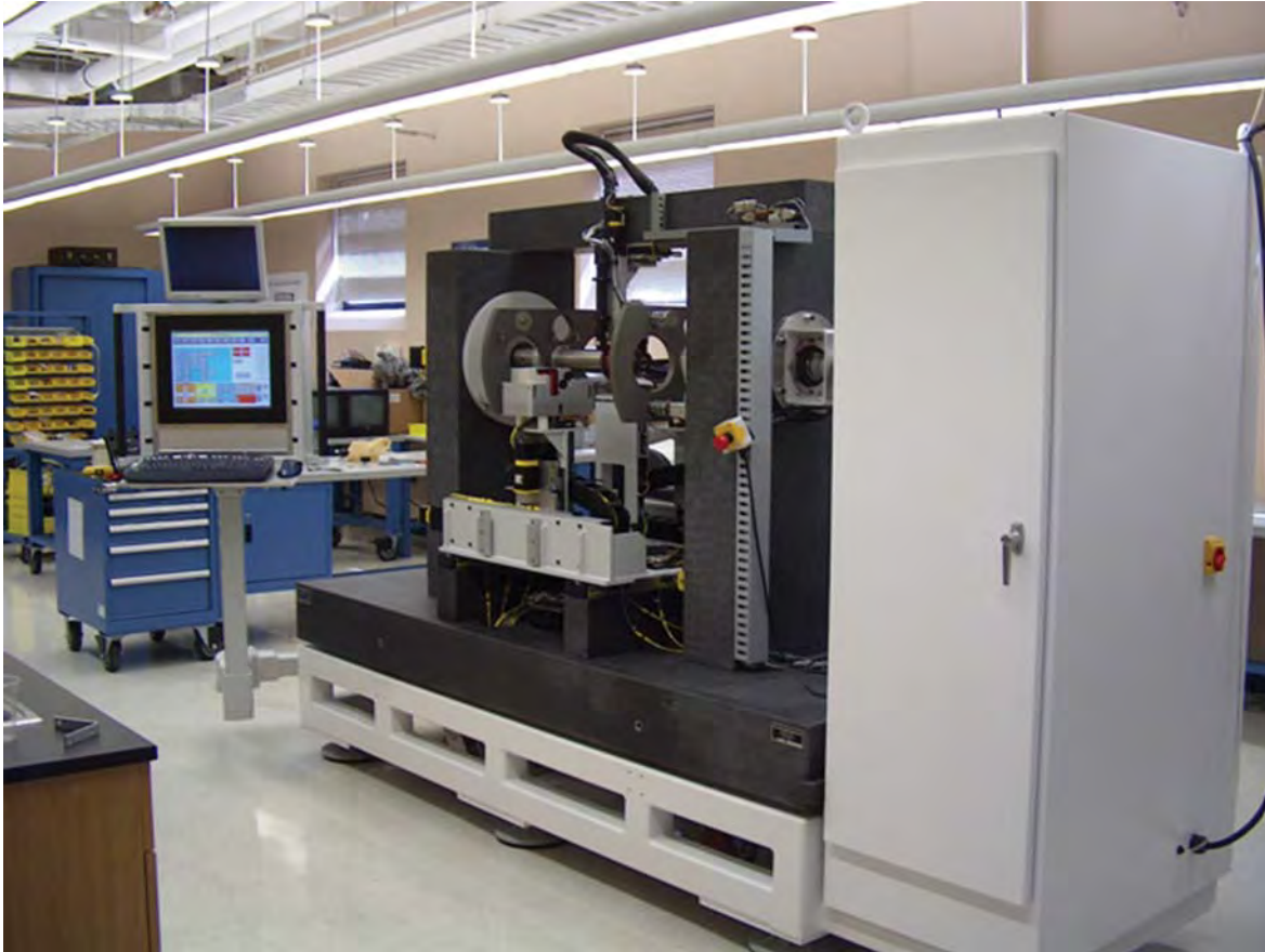
CMI Automated Winder for Fiber Optic Gyroscope Production