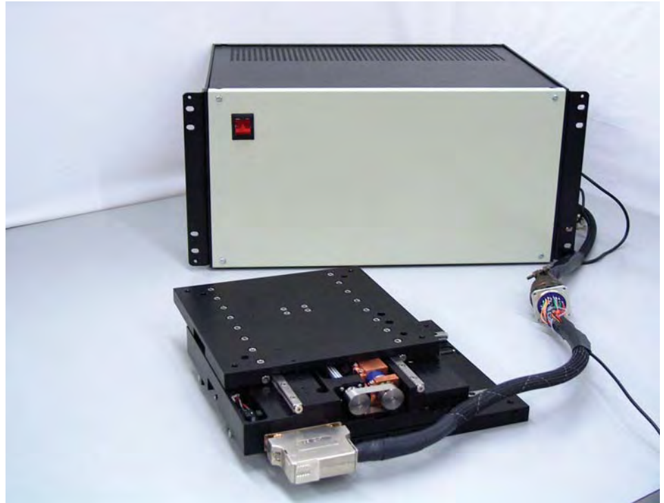
In-Vacuum Positioning System

Fraunhofer CMI has developed a space and environment-optimized in-vacuum positioning system for the use in custom spectrometry instruments. These research tools require precise placement of test samples in the demanding environment of a vacuum chamber. Current designs utilize commercial, "off-the-shelf" linear positioning hardware that is modified to work under vacuum conditions. However, this commercial